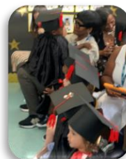
Apples & Seedlings