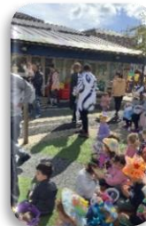
Easter Parade Encouraging parental involvement

Palms room children will experience forming friendships as they learn and develop social skills through play. Staff will use visual aids to explore the topic of Growth and Change. Pictures will be used to show examples of change, such as the seasons changing, a caterpillar turning into a butterfly, or a baby growing into a child. Staff will continue to support the children with transition into big girls and boy's pants, as well as getting some of the children ready to make the move into their new room.