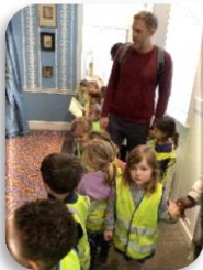
Maples visited The Museum of the Home Palms room explored Mudchute Farm, and Apples spent time at Hackney City Farm